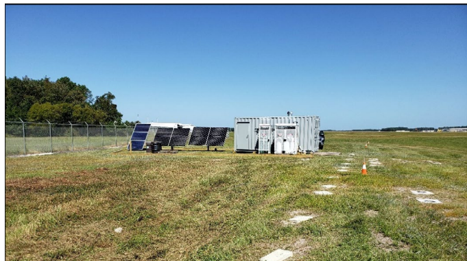
Figure 2: Solar-Powered Biosparging Treatment System